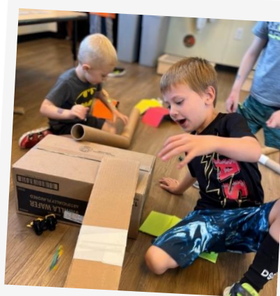
Sculpting Imagination into Reality