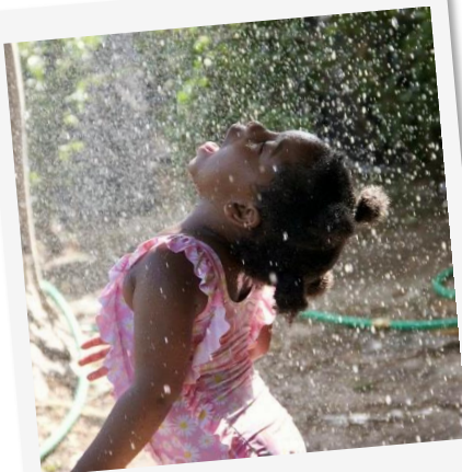
Carefree Summer Bliss

Apply sunscreen to your child prior to coming to camp and provide a hat they may wear during outside play time (please label the hat with your child's name).