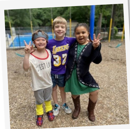
Creating Lifelong Friendships